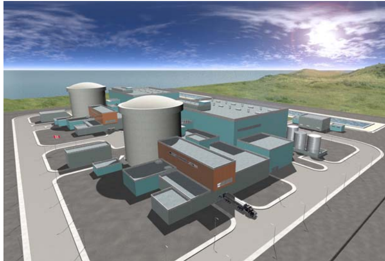
Fig. 1. Two-Unit Enhanced CANDU 6 Plant

State-of-the-art electronic tools for engineering, safety, licensing, procurement, drafting and project management are integrated to provide complete document control during all phases of the project, including construction and commissioning. This information, in electronic format, will be turned over to the Owner for operational and configuration management needs during plant life. Advanced MACSTORTM design for efficient dry spent fuel storage with optimized space usage.